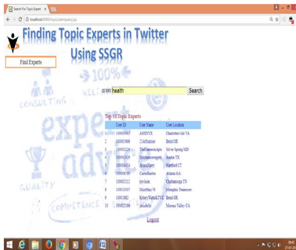
Fig.2 Top experts

Before finding topic expert in twitter, stores data from the twitter. The admin finds top topic expert by giving keyword admin prepare similarity matrix, search experts, search topic in tweets, and also user registered list. Fig.2 shows top experts and Fig.3 shows that Search topic in tweets.